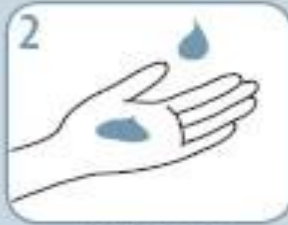
2 Apply soap.