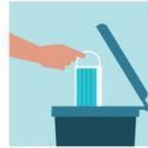
DISPOSE THE MASK IN A CLOSED BIN WITHOUT TOUCHING THE FRONT