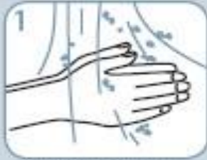
1 Wet hands with warm water.