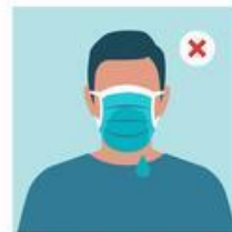
REPLACE THE MASK IF IT GETS DAMP AND DO NOT REUSE IT