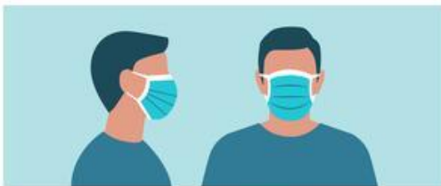
SURGICAL MASK PLACED CORRECTLY