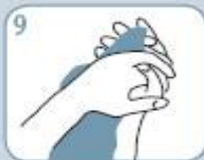
9 Pat hands dry with paper towel.