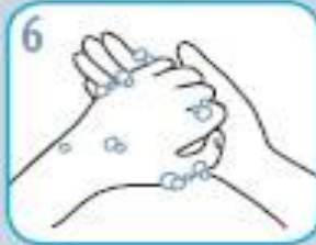
6 Rub fingertips of each hand in opposite palm.