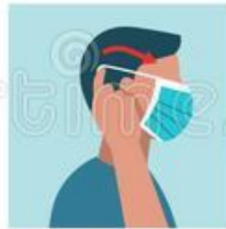
REMOVE THE MASK FROM BEHIND BY HOLDING THE STRINGS WITH CLEAN HANDS