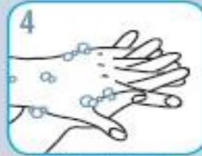
4 Rub in between and around fingers.