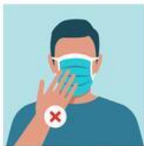
DO NOT TOUCH THE MASK WHILE USING IT, IF YOU DO WASH YOUR HANDS