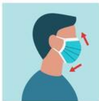
COVER MOUTH AND NOSE FULLY MAKING SURE THERE ARE NO GAPS