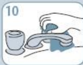
10 Turn off water using paper towel.