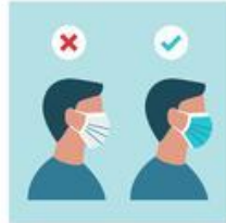
ENSURE THE PROPER SIDE OF THE MASK FACES OUTWARDS