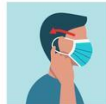
SECURE THE STRINGS BEHIND YOUR HEAD OR OVER YOUR EARS