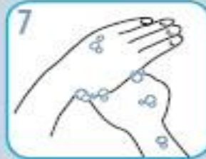
7 Rub each thumb clasped in opposite hand.