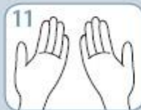
11 Your hands are now safe.