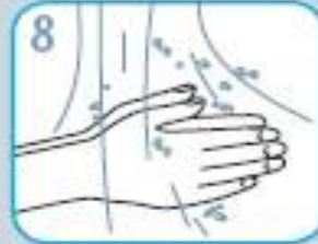
8 Rinse thoroughly under running water.