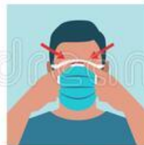
PRESS THE METALLIC STRIP TO FIT THE SHAPE OF THE NOSE