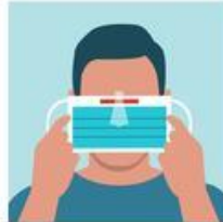
LOCATE THE METALLIC STRIP AND PLACE IT ON THE NOSE BRIDGE