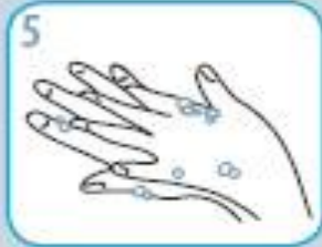
5 Rub back of each hand with palm of other hand.