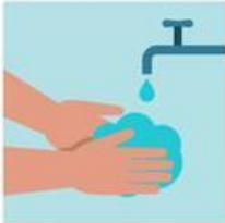
WASH YOUR HANDS BEFORE WEARING A MASK